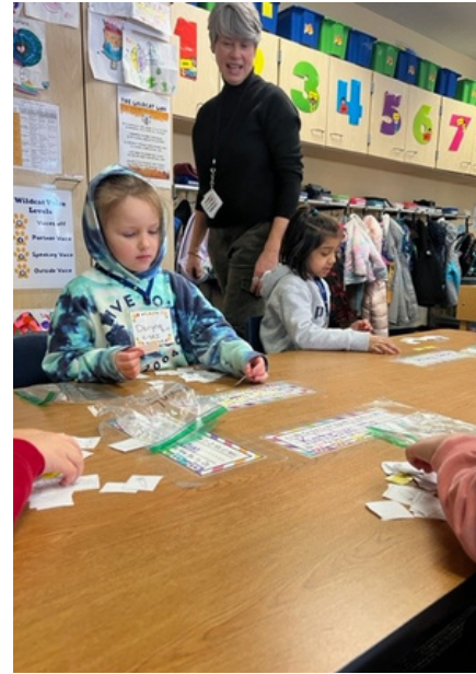
Words their Way