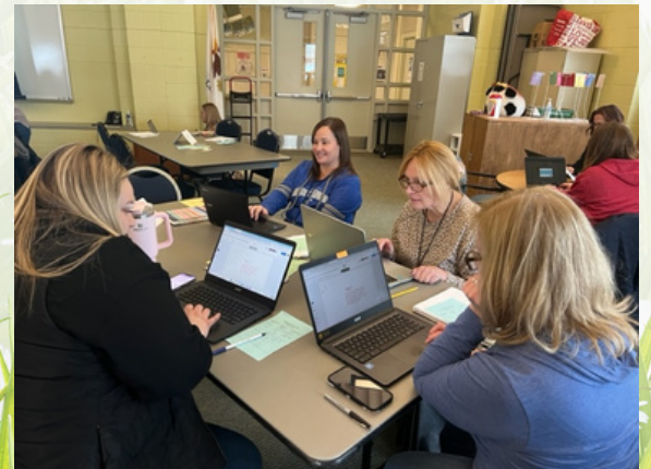
Staff professional development