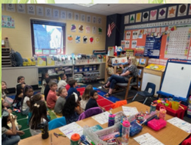
Wildcat Read Alouds