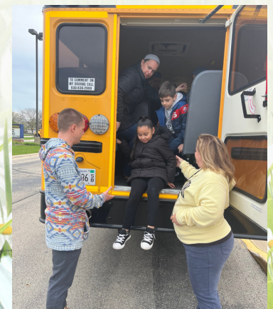
Bus Evacuation Drill