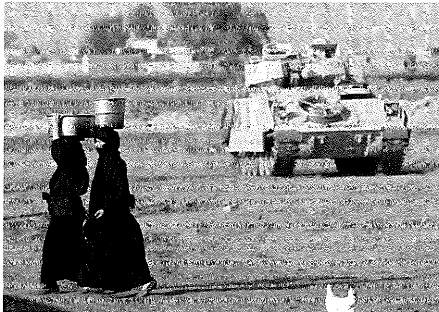
Iraqi women carry water home. Throughout the war, U.S. troops and tanks were a constant presence in the lives of Iraqis.

U.S. President Barack Obama has linked U.S. success in Afghanistan to the stability of Pakistan. Pakistan has long played an influential role in events in Afghanistan. In the