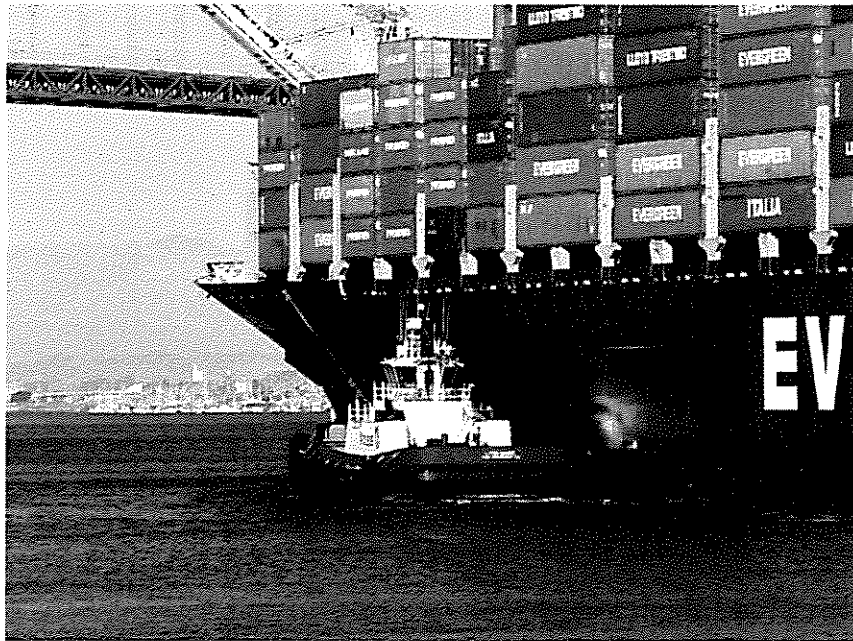
A cargo ship at a port in Los Angeles, California. Shipping on the sea accounts for billions of dollars each year for the U.S. economy.