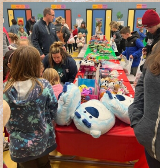
PTA HOLIDAY SHOP