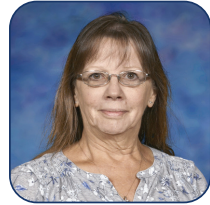
LAURETTA KING District Administration Center